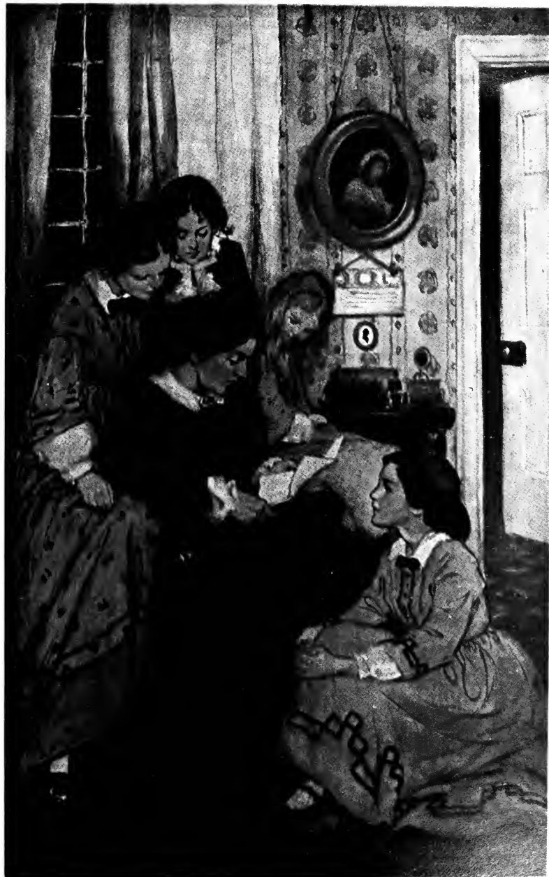
They all drew to the fire. Page 9.